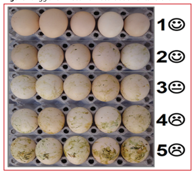
Figure 1: Egg shell meconium score at chick take-off.

The degree of meconium staining on egg shells at take-off is a good indication of whether or not chicks have been held in the hatcher for too long and are therefore at potential risk of dehydration. The dirtiest egg shells from five randomly chosen baskets per flock should be scored for degree of meconium staining ( Figure 1 ).