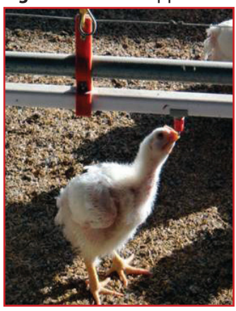
Figure 3: Correct nipple drinker height adjustment with bird age.