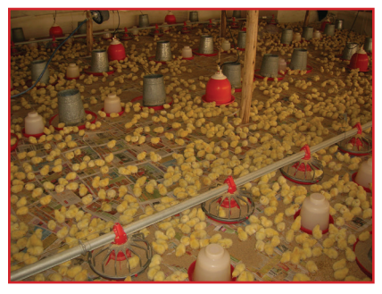
Figure 4. Chick behavior under different environmental conditions.

Chick behavior when environmental conditions are correct. Chicks are spread evenly throughout the brooding area.