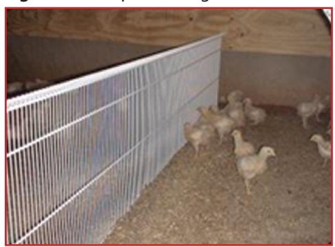
Figure 2: Example of a migration fence.

Migration fences ( Figure 2 ) installed at 30 m (100 ft) intervals, creating pens of equal size, will help maintain an even stocking density throughout the house. Fences should be installed as soon as birds have access to the whole house. Solid migration fences should not be used as they will restrict airflow.