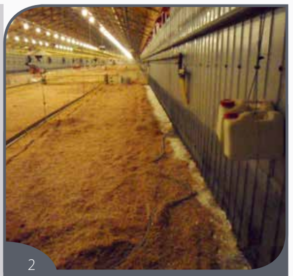
Boric acid application in the litter