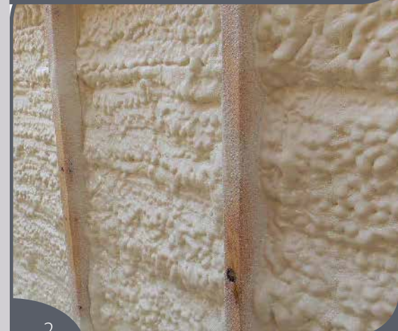
Insulation saturated with boric acid