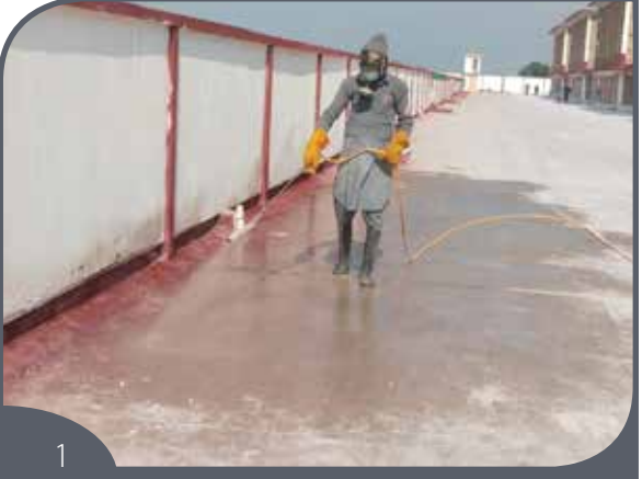
Insecticide application outside the house

Insecticide applied before chick placement