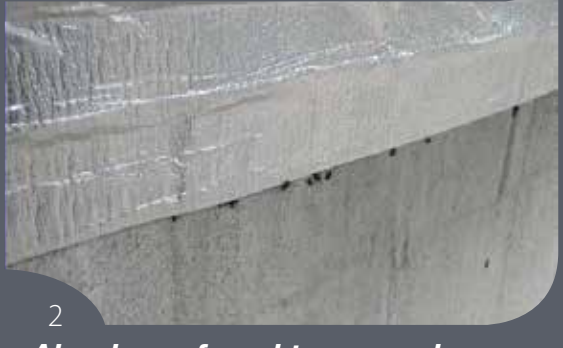
Aluminum faced tape used as a barrier for darkling beetles