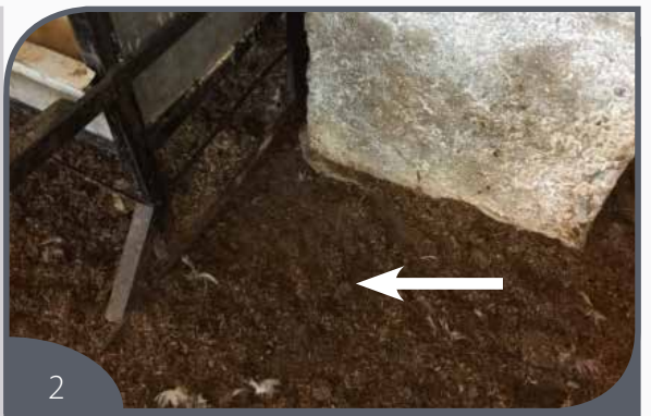
Darkling beetles under manual nests

Insecticide application and a detailed cleaning and disinfection program are essential to control.