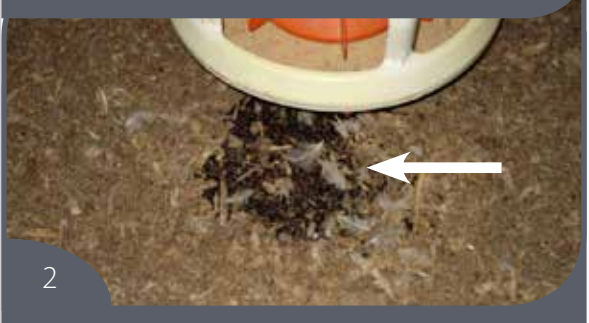
Darkling beetles under feeders