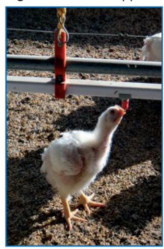
Figure 3: Correct nipple drinker height adjustment with bird age.