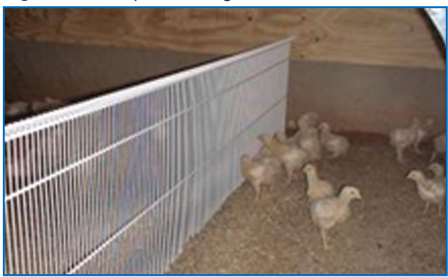
Figure 2: Example of a migration fence.

Migration fences ( Figure 2 ) installed at 30 m (100 ft) intervals, creating pens of equal size, will help maintain an even stocking density throughout the house. Fences should be installed as soon as birds have access to the whole house. Solid migration fences should not be used as they will restrict airflow.