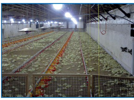
Chick behavior when environmental conditions are too hot. Chicks are crowded near house walls or brooding surrounds, away from heating sources and/or they are panting.

It is always a good idea to check crop fill to make sure brooding conditions are correct and that feeding and drinking have been encouraged ( Table 5 ).