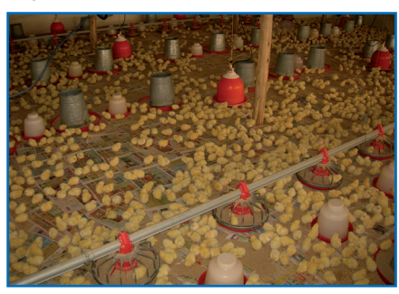
Figure 4. Chick behavior under different environmental conditions.